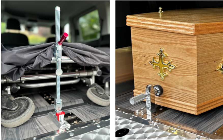
Coffin Stops & Stretcher Clamps